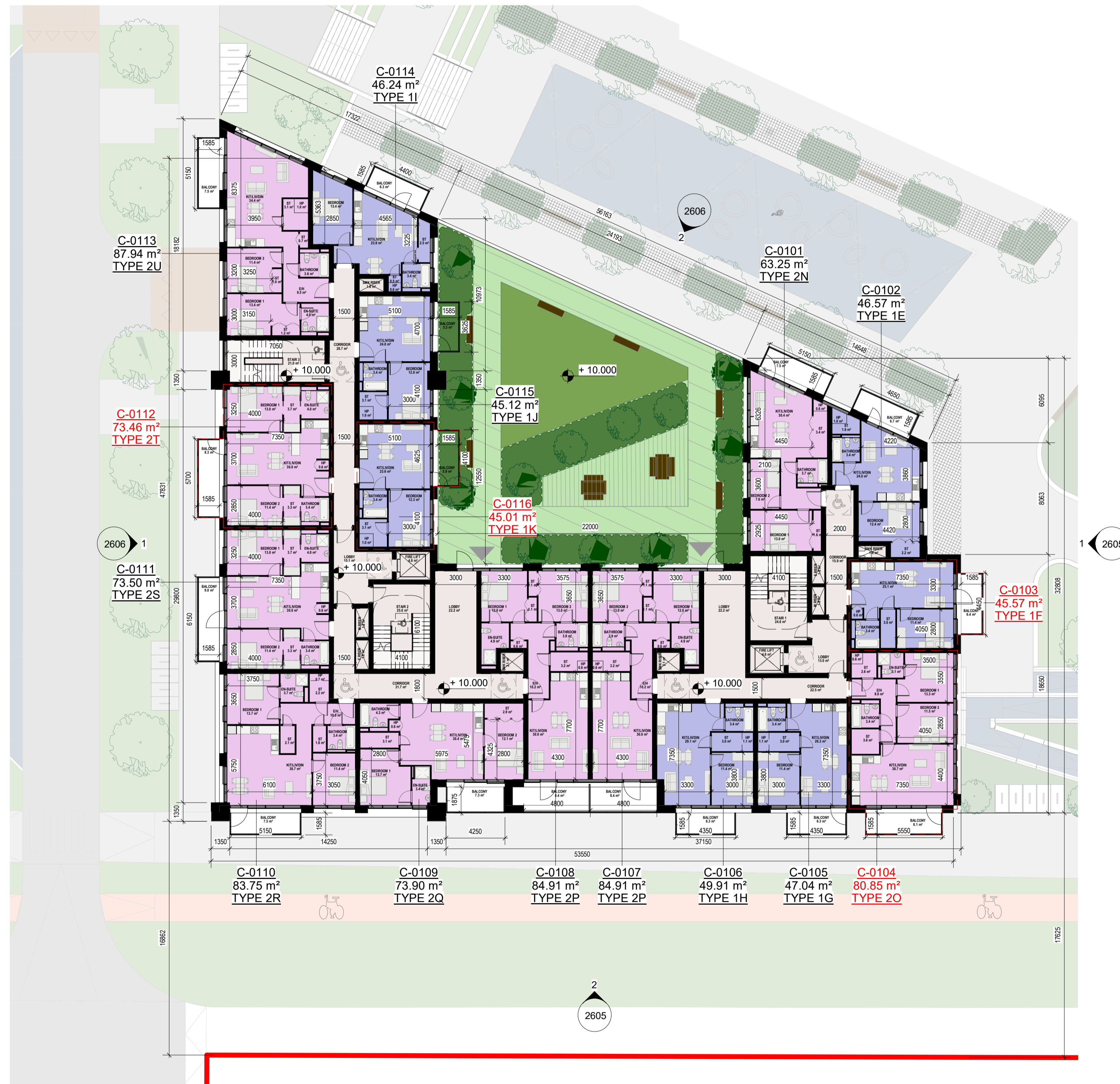
1 PLAN - BLOCK C - LEVEL 01 - PART V 1 : 200

FLOOR PLAN KEY: PROPOSED PART V UNITS, INCLUDING PRIVATE AMENITY SPACE PROPOSED PART V APARTMENTS NOTED IN RED